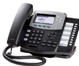
D50 / Mid-level