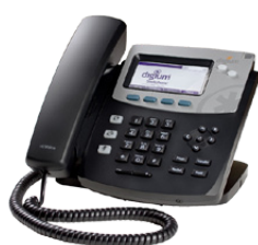
D40 / Entry-level