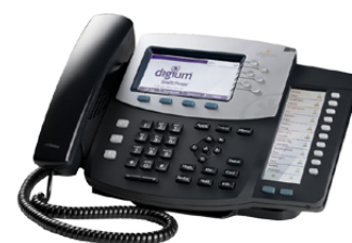
D70 / Executive-level